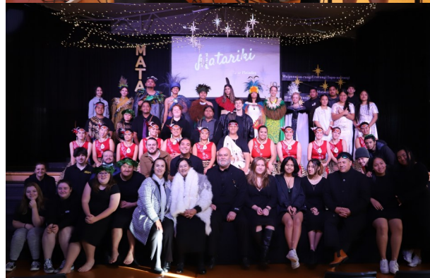
Amazing cast of the School Production 2022 'Matariki'