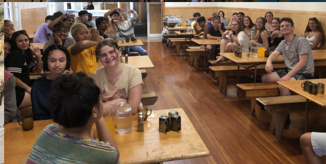
Year 13 Camp at the Christian Youth Camp in Raglan