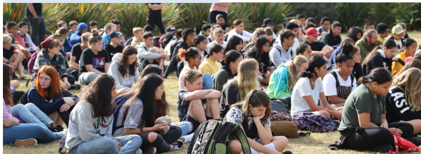
New students and staff welcomed to Fairfield College