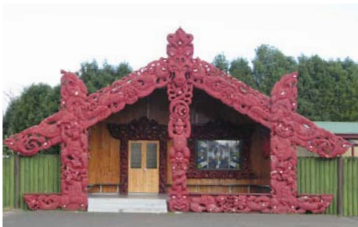
Te Iho Rangī, Te Aratiatia Marae - Fairfield College

Nau mai, haere mai. All students with an interest in learning about and expressing aspects of Maori culture can do so in the following areas. Te Reo Maori: learning Maori language, NCEA Level 1, 2 and 3. Maori Performing Arts: level 2 and 3. Learning knowledge and skills in Waiata, Waiata-a-ringa, Haka, Poi and Whakaraka. Kapahaka: a performance group for students at any level. Maori knowledge is valued and taught in curriculum areas.